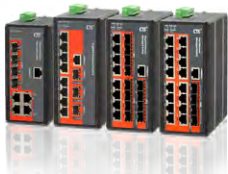
Industrial GbE Managed Switch IGS-1604SM & IGS-812SM & IGS-803SM & IGS-404SM