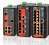
Industrial FE Managed Switch IFS-1604GSM & IFS-803GSM & IFS-402GSM

• The specification and pictures are subject to change without notice.